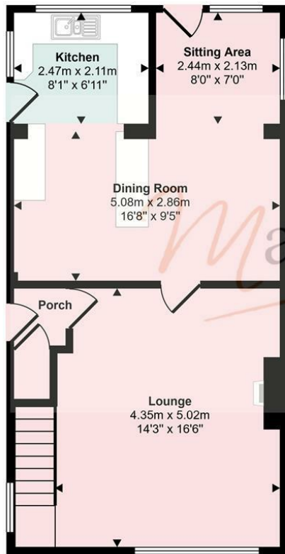
Ground Floor Approx 52 sq m / 564 sq ft